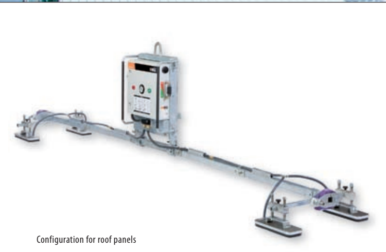
Configuration for roof panels