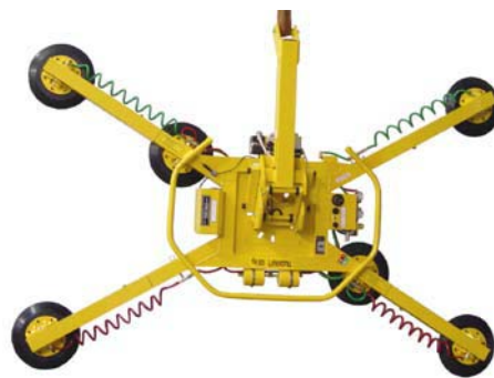
Shown with Dual Vacuum System