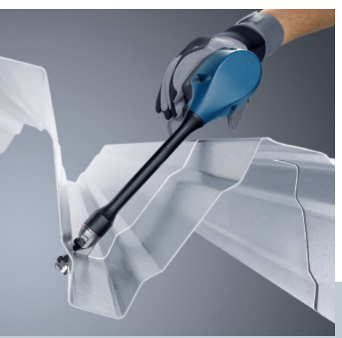
Diagonal cutting on deep corrugated roofing