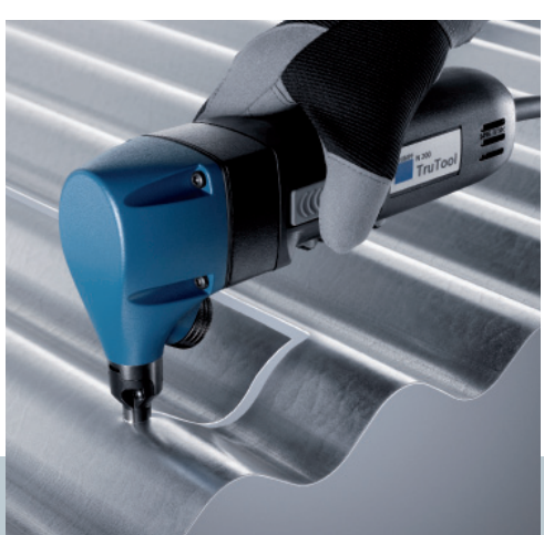
Highest curve maneuverability