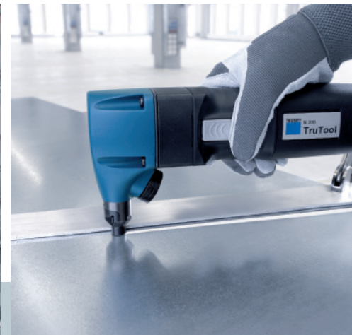
Cut-to-fit cable trays