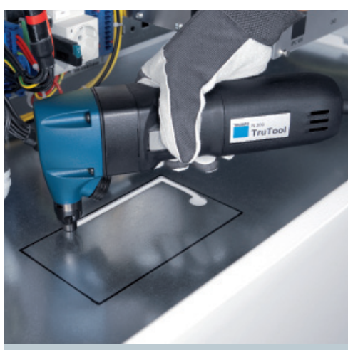
Works well in hard-to-access areas